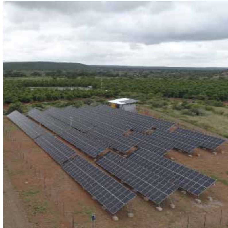
A small scale African Solar Park