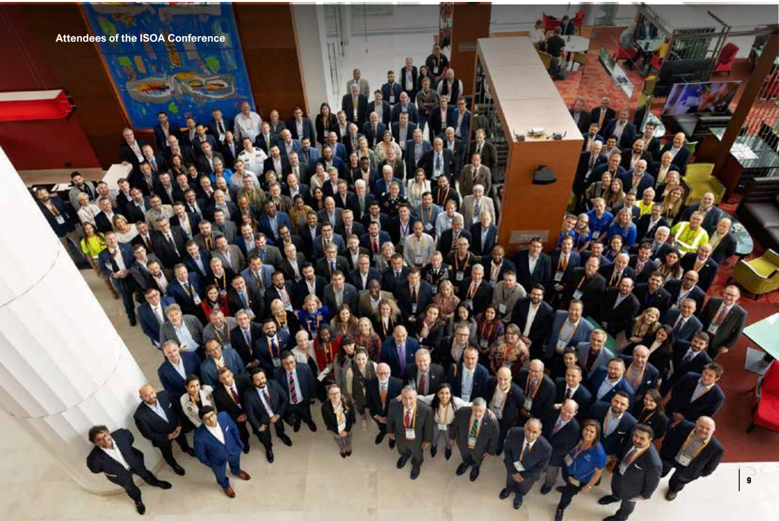
Attendees of the ISOA Conference

International Stability Operations Association (ISOA) is the only worldwide association exclusively focused on effectively representing the stability sector. ISOA members, like SKA, work together with key organizations and government policymakers through partnerships, engagement, and advocacy, with the shared objective of promoting long-term stability and growth in the world's most volatile regions. SKA's team, led by the CEO, attended the ISOA Ukraine Conference last year and the Middle East Conference this year, meeting many friends and rekindling long-standing relationships. Networking with industry peers and colleagues is starting to bear fruit in the form of new business contracts and agreements with more to come.