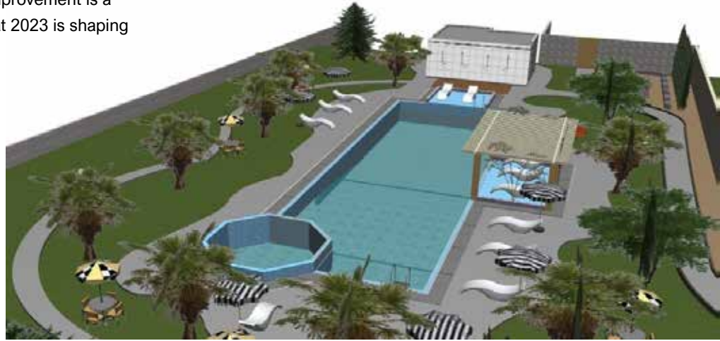
Model of the new pool

SKA in Somalia is gearing up for an exciting year ahead with the completion of the new pool in Q2 of 2023. This new addition to our services will be the most exceptional facility in the country, offering a luxurious experience for clients and employees alike. With more accommodation space than ever before, our occupancy rate in Q1 2023 has already reached an impressive average of over 90%. We understand the importance of attracting clients, and this improvement is a meaningful step forward. It's safe to say that 2023 is shaping up to be an exciting year!