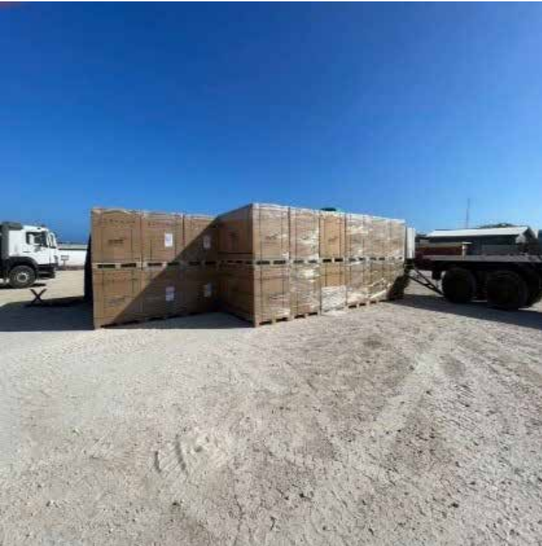
SKA take possession of the first Solar Panels

2030. SKA has been playing a crucial role in making this project a reality. We have already cleared, forwarded, and stored the first technical components in Mogadishu, and our team is set to further assist Kube Energy with the installation, commissioning, and operation of the solar farm in Baidoa.