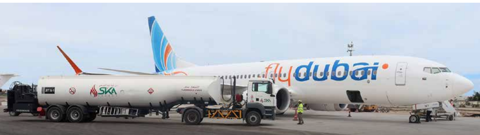
SKA truck fueling FlyDubai aircraft

FlyDubai, as well as one of our oldest customers - the US Defense Logistics Agency. The team continues to receive all types of new equipment required to perform work, ranging from JIG-compliant ladders to PPE. The construction of the new tank farm is now in the final stages and SKA is collaborating closely with its JV partners to ensure timely completion in line with regulatory standards.