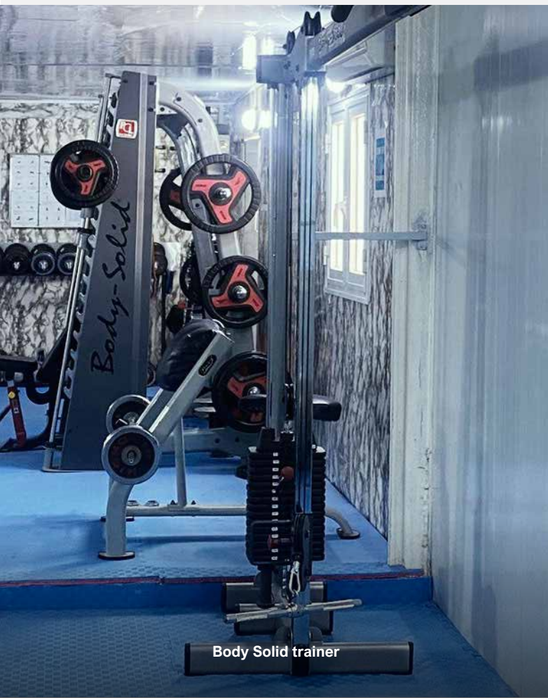
Body Solid trainer

The KAFZA Upgrade program continues at pace. The successful installation of “internal floating roofs” in all remaining tanks last year was a significant milestone, allowing for the handling of multiple products. To further improve efficiency, the original product pumps have been replaced, resulting in a two-fold increase in product transfer speed. The maintenance engineer, Mustafa Hamid, deserves special recognition for his innovative solution to the problem of dead stock (the hard-to-get-at stuff at the bottom of the tank). What once took hours can now be accomplished in minutes, much to the satisfaction of our valued customers.