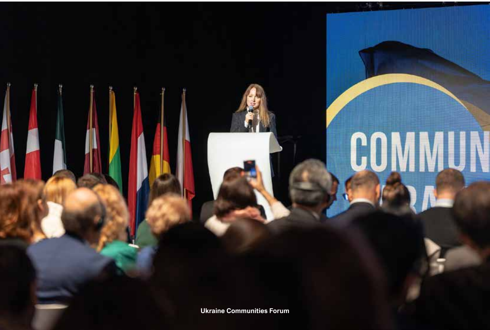
Ukraine Communities Forum