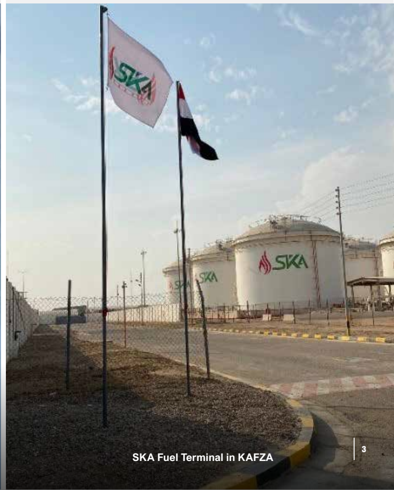
SKA Fuel Terminal in KAFZA