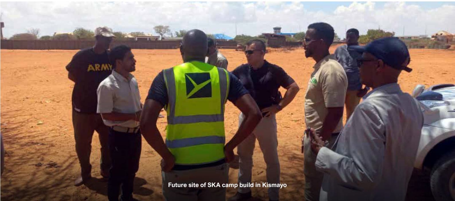
Future site of SKA camp build in Kismayo

Expanding our operations in Kismayo is in line with significant investment in the region by the UAE Government and others. This investment will see the clearance of the seaport, rehabilitation of the jetties and the construction of a Fuel Terminal, bringing much-needed modern infrastructure to southern Somalia. This maritime improvement will be matched by upgrades to the airport, conducted by SKA, to attract more international cargo and passengers, and build a logistics hub for Jubbaland.