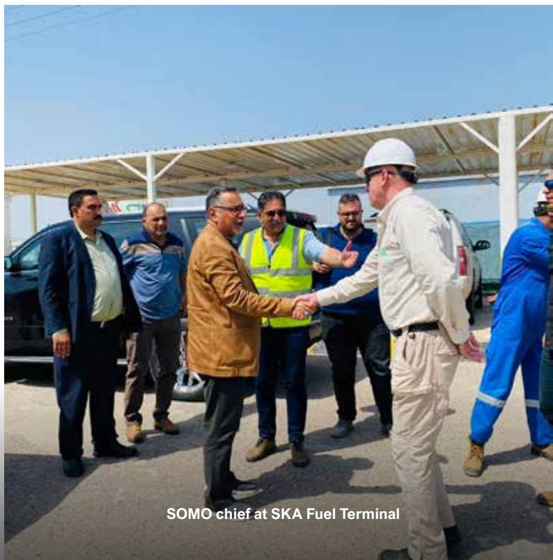
SOMO chief at SKA Fuel Terminal