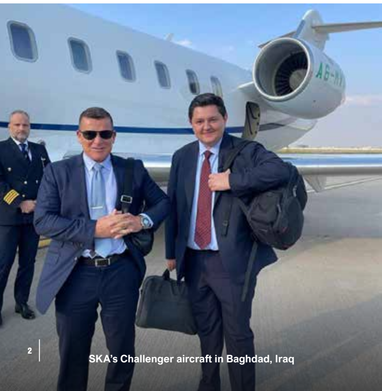
SKA's Challenger aircraft in Baghdad, Iraq